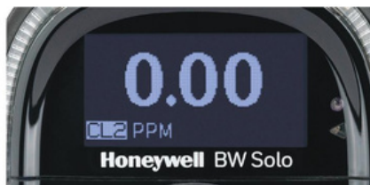
Easy to read