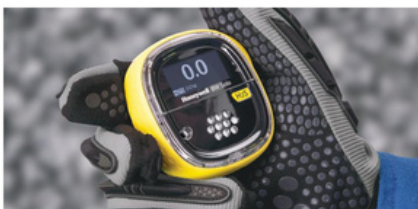
Easy to handle